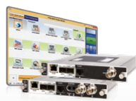
10G multiservice test modules FTBx-8870/8880