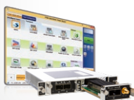
100G multiservice test module FTBx-88260/FTBx-88200NGE