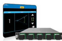
MEMS optical switch FTBx-9160 (1x2, 1x4 configuration)